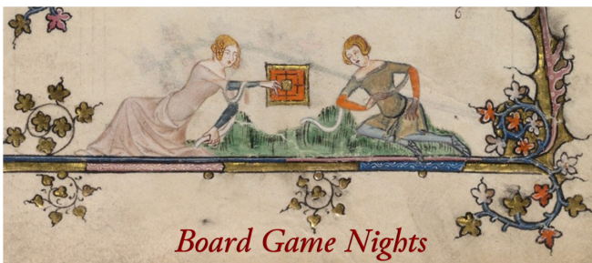
Board Game Nights

Village Life Weekends: 12:00 pm - 5:00 pm, June 14-15, 28-29, July 5-6, 12-13, 19-20.